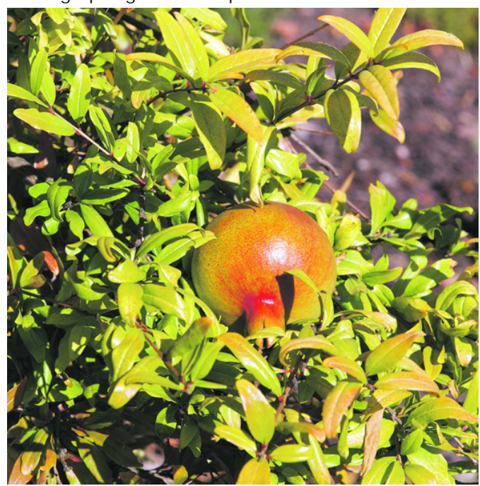
pomegranate from fruit tree