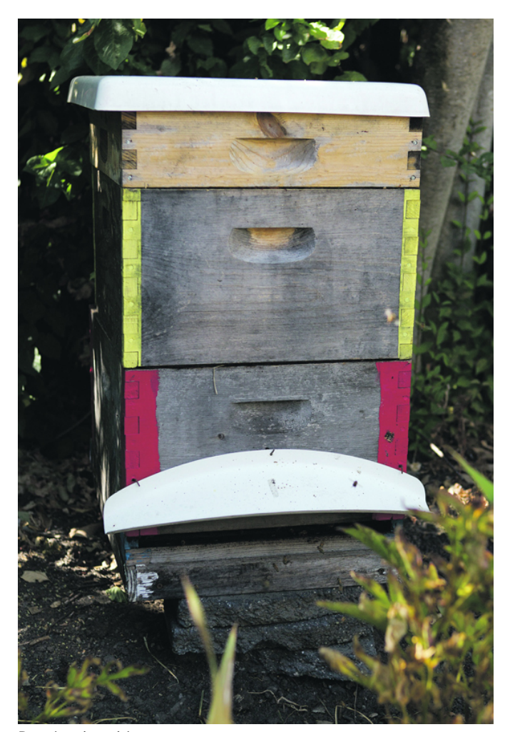
Buzzing bee hive