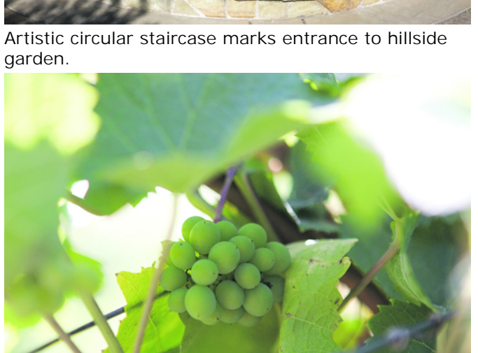
Table grapes grown with pinot noir vines